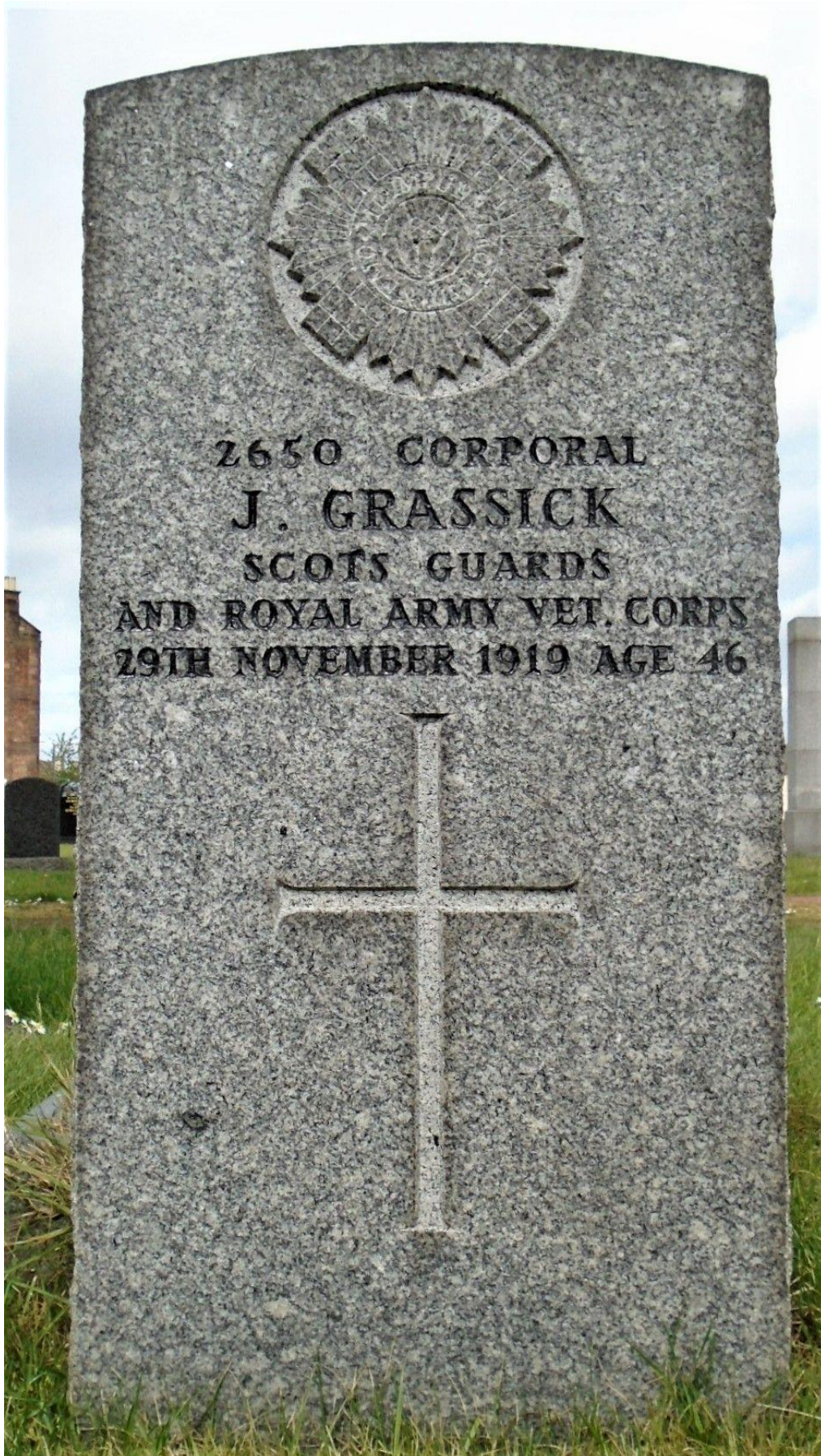
Photo of Corporal J. Grassick's Commonwealth War Graves Commission Headstone in Eastern Cemetery, Edinburgh, Scotland.